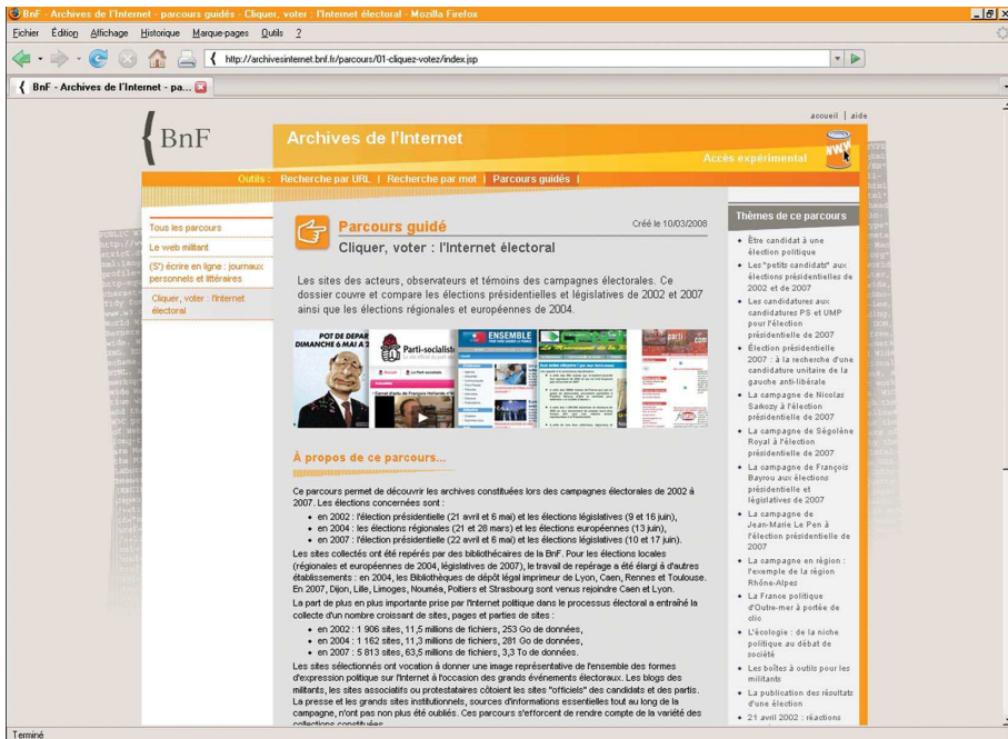
Fig. 3: 'Click and vote: the electoral Web' featured collection.