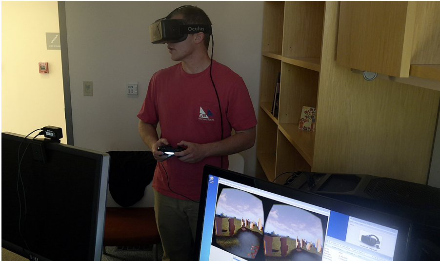
Fig. 1. One of the participant experiencing scenario A2 with the Oculus Rift, while his actions are recorded and monitored on the instructor screen.