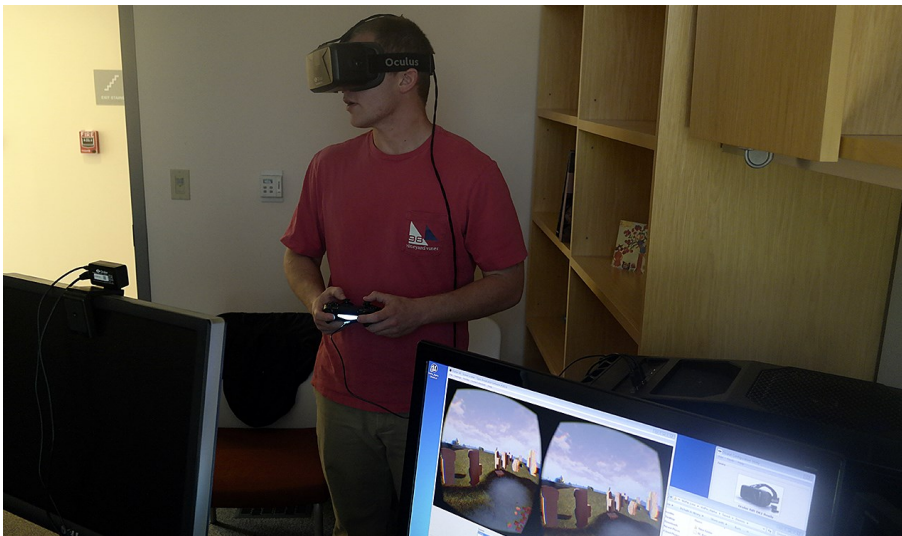
Fig. 1. One of the participant experiencing scenario A2 with the Oculus Rift, while his actions are recorded and monitored on the instructor screen.