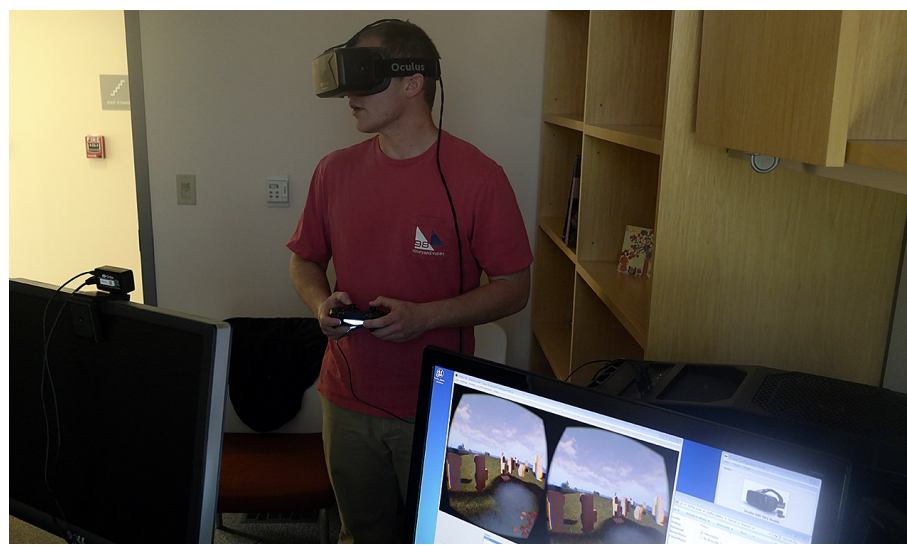
Fig. 1. One of the participant experiencing scenario A2 with the Oculus Rift, while his actions are recorded and monitored on the instructor screen.