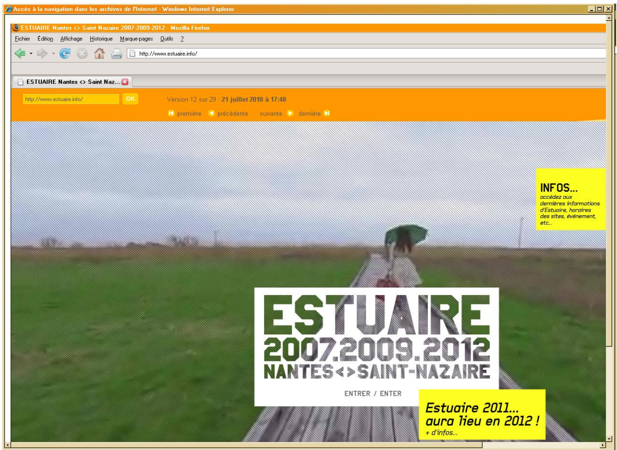
http://www.estuaire.info (Archives de l'Internet, 21 juillet 2010)

• Finally we share the harvest of contemporary creation with other <u>departments of the BnF</u> which traditionally acquire works by media : the Audiovisual department, in charge of the multimedia and on-line creation, the Prints and Photographs department, and the Books'history department in charge of artists' books and graphic art.